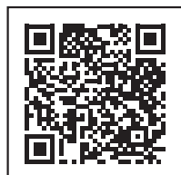
View Pre-Clad Door Frames

FrontLine® Bldg. Products introduced the composite door jamb material to our customers as an alternative jamb material back in 2015. Since then we have expanded our entire offering to include engineered mull posts that allow our door fabricators to build on a sill platform that is storm door applicable. Soon to follow was our composite pre-clad offering. Combining the longevity of composite material and durability and stability of our proprietary extruded aluminum cladding.