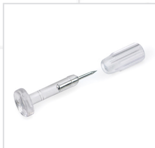
Push Pins & Grommets