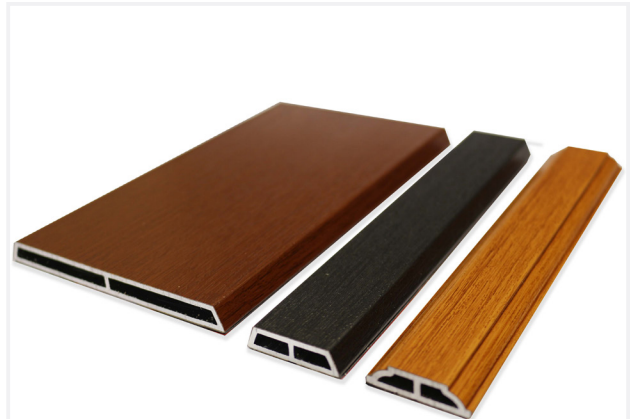
AL810 • AL403 • AL402