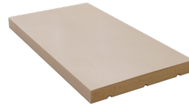
Primed Flat Jamb