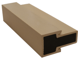
Co-Extruded LVL Mull Post with Composite Bottom

FrontLine's Composite frame is a unique formulation that combines the strength and stability of wood without the rotting, warping and splitting. The FrontLine® Composite Frame is resistant to mold, mildew, fungus, salt, chemicals, insects, and pollutants, leaving your entryway frame maintenance-free! The FrontLine® Composite Frame has the same shape designs, use, and functionality as wood, and can be similarly painted, stained, nailed, and machined.