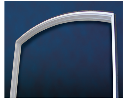
Arch Top Frames—The Look of Today